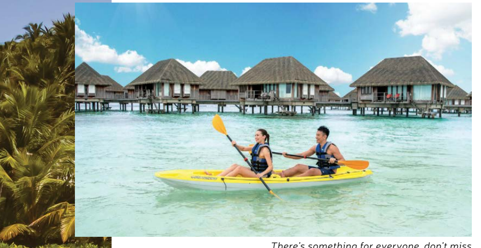
There's something for everyone, don't miss out on any of the action