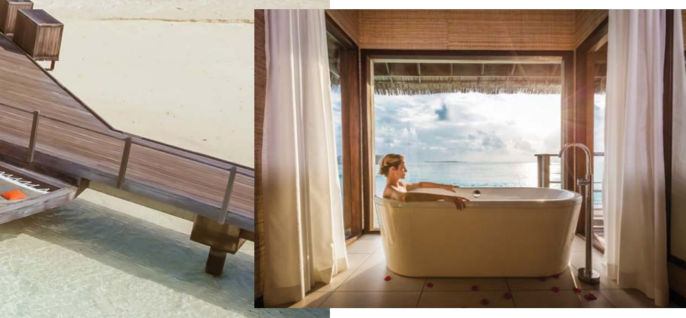
Soak in your own private tub, relax your mind to the view of the Indian Ocean

hinking of heading to the Maldives sometime? Check out Kani, a Club Med-managed getaway at the heart of a private island in the Maldives. With cozy accommodations set in either the lush natural gardens or directly on the sandy beach with unspoilt ocean views, the resort is also the home of the Manta Exclusive Collection, which is comprises of overwater suites that has direct access to the crystal blue lagoon below.