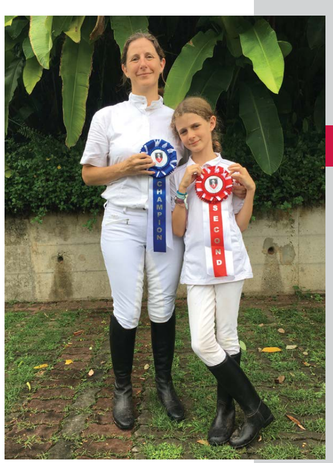
Winning together at the November 2017 show in SPC