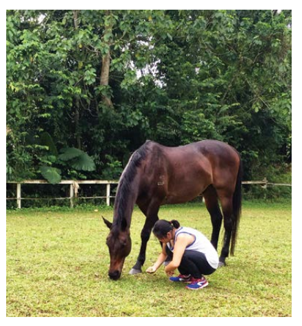
Client working on connection with the horse

I am excited for the opportunity to be in partnership with the polo club in