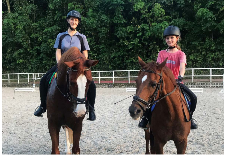
Mother and Daughter riding together