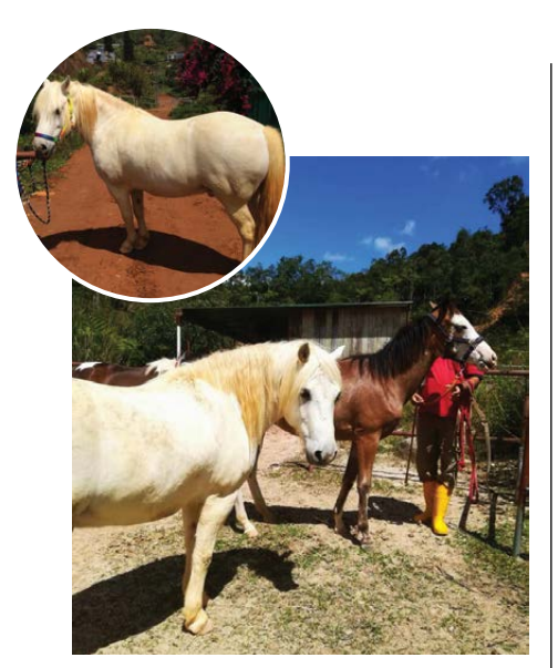
Napoleon with Highland Star