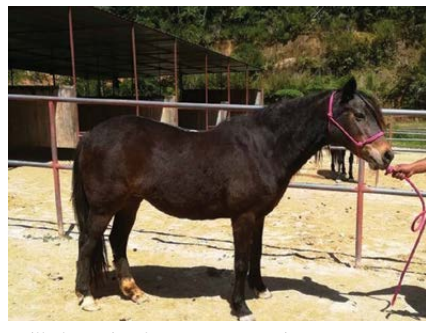
Still charming hearts post-retirement